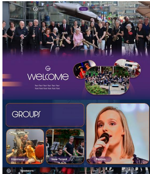
Fig. 2 First Design

After creating the first design, I asked my groupmates for some feedback on the prototype, and they have pointed out some parts that need improvement. So, I changed it to something simpler with a white-colored navigation bar, and purple texts. Scrolling down, I also changed the background color of the orchestra's brief description to plain white and removed the images on the side. In the gallery, the boxes were unevenly sized, and I was told to keep the pictures and boxes smaller because it was kind of overwhelming. Lastly, I added a sitemap for the website's footer.